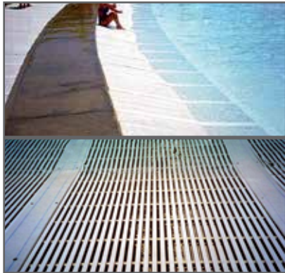
“The Beach” - Mandalay Bay

Safe-T-Span® pultruded grating, Fiberplate® and Dynaform® structural shapes were used to create this wave pool break. When the pool was originally built, the waves would wash up on the beach soaking everything in its path. The architects needed to create an area which would allow the waves to disperse and drain back into the pool. With its corrosion- and slip-resistant and thermally non-conductive properties, Safe-T-Span is the perfect solution.