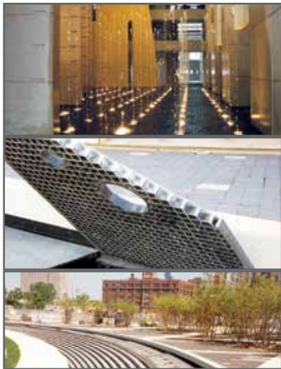
McCormick Place Fountain

When the city of Chicago decided to dress up their expanded and renovated convention centre, McCormick Place, they chose Fibergrate® covered grating. The covered grating was used to create fountains in an outdoor 5-acre plaza (McCormick Square) and indoors in a 900-foot long Grand Concourse which also houses retail shops and restaurants. The light weight of the covered grating allowing workers easy access to pipes as well as excellent corrosion resistance make Fibergrate® the best solution.